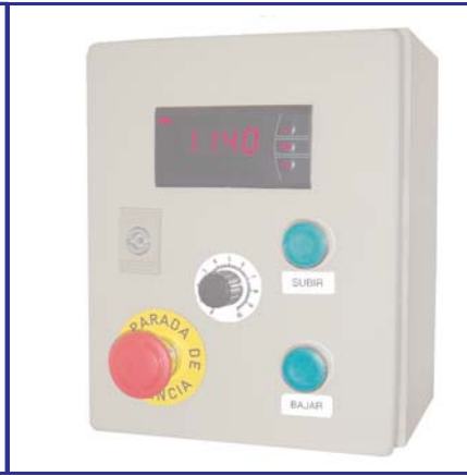
Display IP-55 (normal)