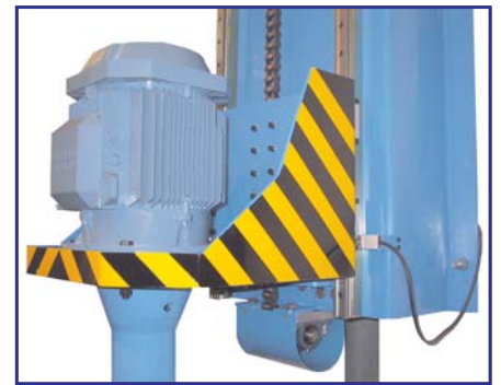
Detail of elevation