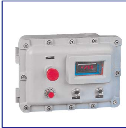
Display EExd (flameproof)