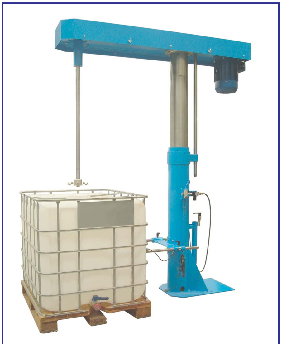
Detail of agitator for containers